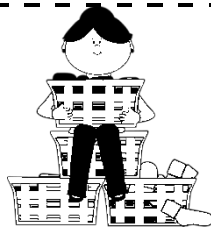
Mom is among the laundry.