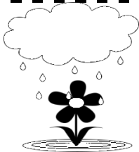
The cloud is above .